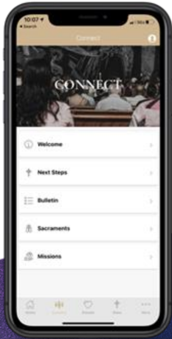
List with icons